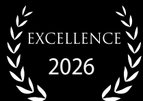
Chinese Business of the Year Award

This award is intended to recognize an individual, Chinese or non-Chinese, whose community involvement has demonstrated a significant contribution to the Chinese community.