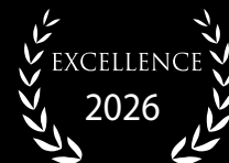
Customer Service Award

This award is intended to recognize a Chinese individual who is not only dedicated and creative in problem-solving, but also strives to exceed customer expectations among and beyond the Chinese community.