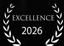
Chinese Consumer Choice Award

The value of an MCBG award is powerful in terms of its endorsement of value and vision, and its ability to boost recognition among the Chinese community. Winners will be announced at the 2026 Manitoba Chinese Business Gala on February 6.