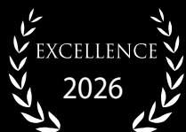
Community Service Award

This award is intended to recognize a company, Chinese or non-Chinese, that is known for its dedication to superior service among the Chinese community.